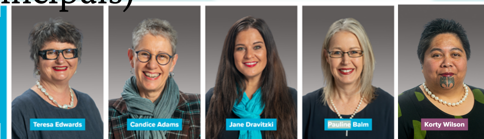
Principals in their first 3 foundational years